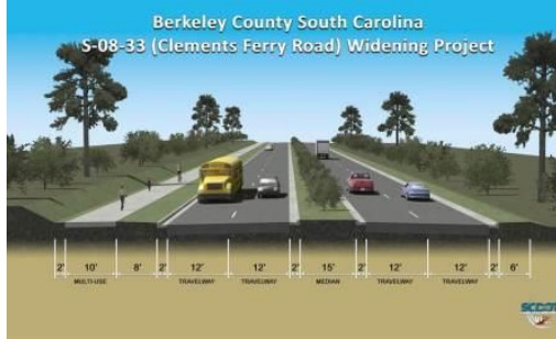
Project Map / Design Image