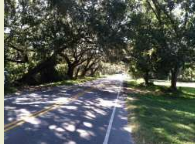
Unique Natural Beauty