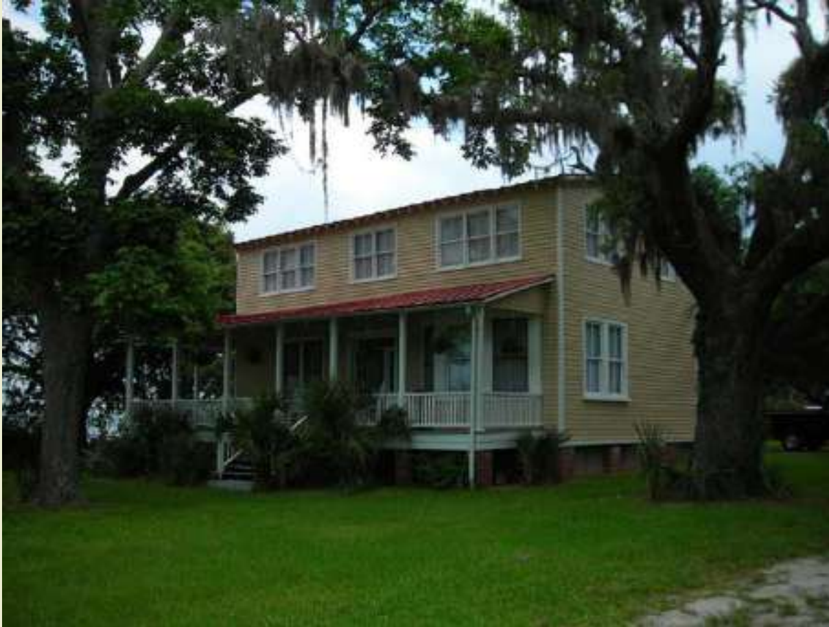
Caretaker's House – Dill Sanctuary c. 1915