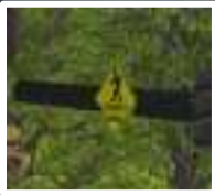
Mast-arm mounted "YIELD TO PEDS" signs on Folly Road