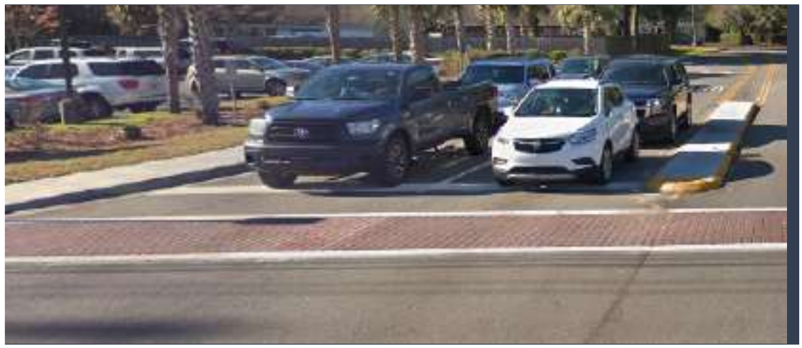
Red brick Street Print crosswalk matching Camp Road