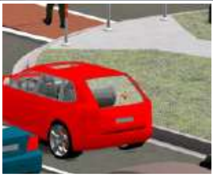
Tighten curb radius at SW corner of intersection