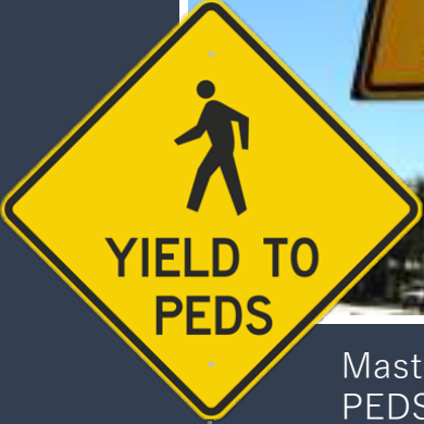
Mast-arm mounted “YIELD TO PEDS” signs