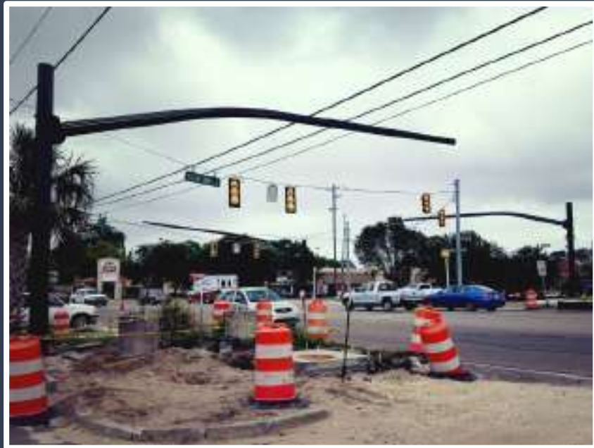
Signal mast arms upgrade matching Camp Road