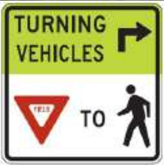
Mast-arm mounted “TURNING VEHICLES YIELD TO PEDESTRIANS” signs on George Griffith Boulevard