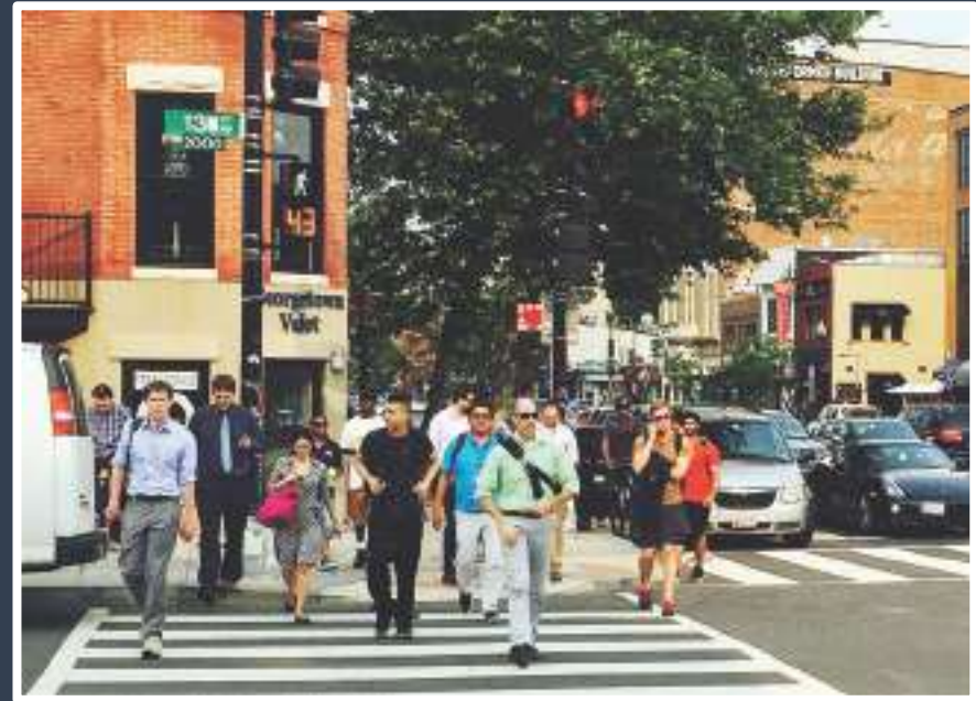
Modify signal timing to give pedestrian-lead phase