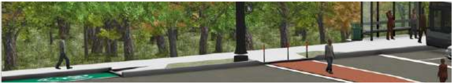
Reduce outside lane width of NB Folly Road