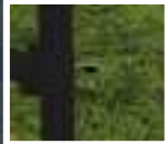
Pedestrian detection photo sensor cameras