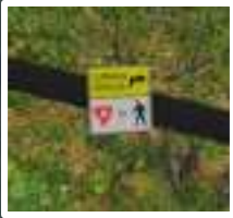
Mast-arm mounted "TURNING VEHICLES YIELD TO PEDESTRIANS" signs on George Griffith Boulevard