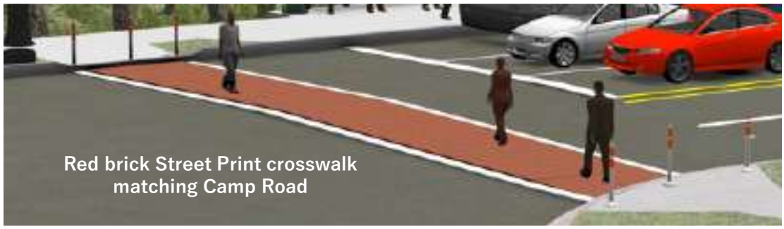
Red brick Street Print crosswalk matching Camp Road