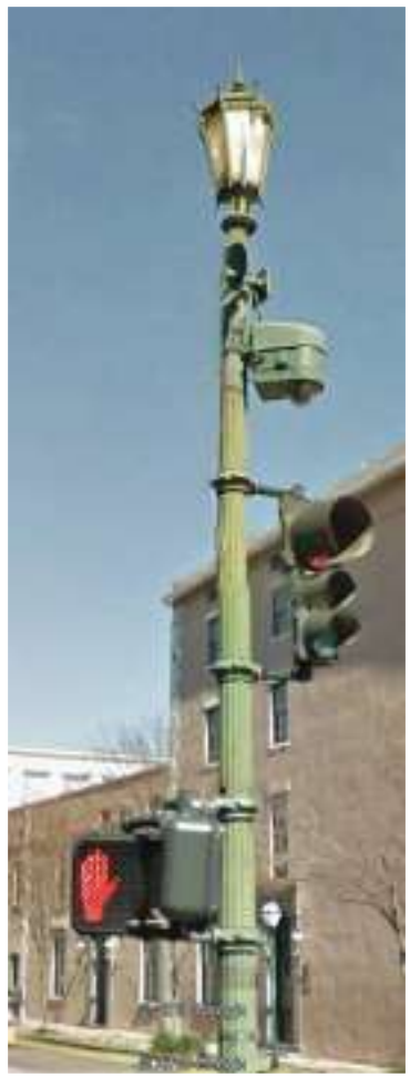
Pedestrian detection photo sensor cameras