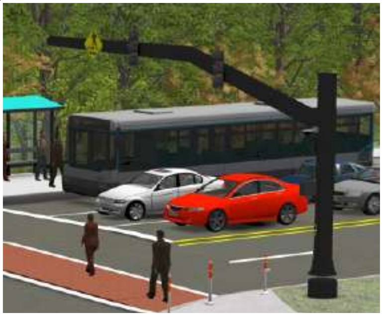
Signal mast arms upgrade matching Camp Road

Modify signal timing to give pedestrian-lead phase