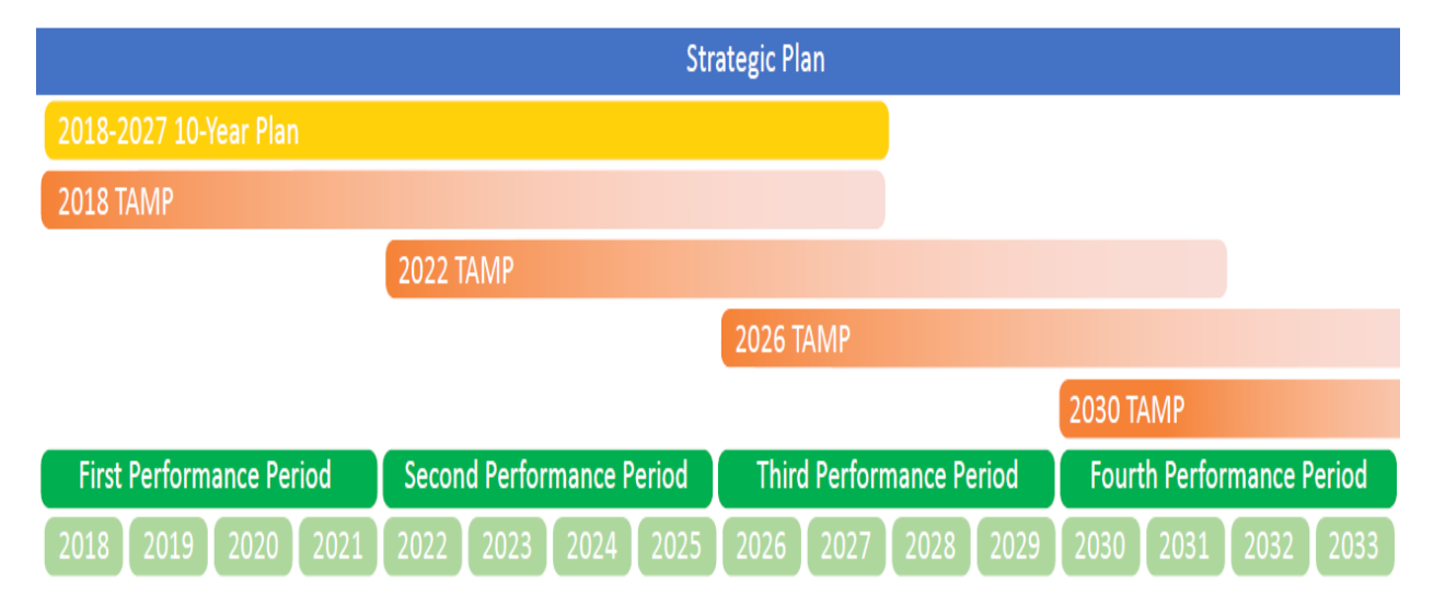
Figure 1. STAMP Timelines and Horizons

This System Performance Report presents the baseline, performance/condition measures, targets and the progress made towards achieving those targets. These performance measures are a part of SCDOT's Strategic Ten-Year Asset Management Plan (STAMP). SCDOT's STAMP has been developed in a collaborative effort with South Carolina's Division Office of the Federal Highway Administration (FHWA). The plan has been designed to not only satisfy federal rulemaking, but to transcend these requirements by setting performance estimates for all state maintained roads and bridges. By clearly identifying the needs of South Carolina's transportation infrastructure, the STAMP has provided SCDOT a platform to communicate existing infrastructure conditions and project constrained performance targets for SCDOT's physical assets over the next decade. The STAMP is an all-inclusive document that houses the Strategic Plan, Ten-Year Plan (2018-2027), Asset Management Plan (2022-2032) and Performance Measures. The timelines and horizons are illustrated below in Figure 1.