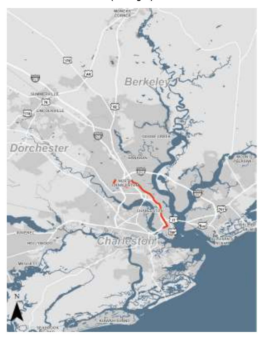
Figure 10: Corridor H | Airport/Boeing to Downtown Charleston (Meeting St)

Due to its moderate performance, duplication and similarities with Corridors E and F, it is recommended that Corridor H does not move forward for additional analysis.