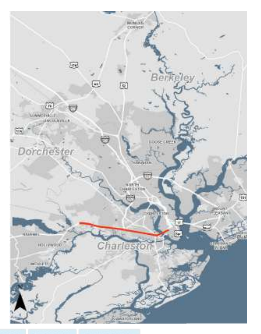
Figure 14: Corridor L | West Ashley to Downtown Charleston (Hwy 17)

Corridor L is very similar to Corridor K and did not perform well mainly because it lacks a good anchor at the end of the line near Bees Ferry Road. It also does not provide a direct connection to the Citadel Mall area, which Corridor K does.