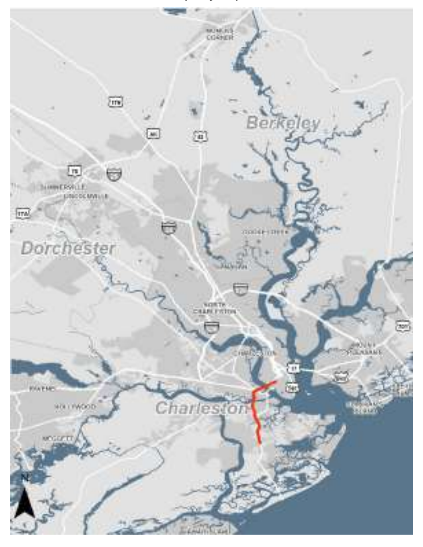
Figure 15: Corridor M | James Island to Downtown Charleston (Folly Rd)

The recommendation for this corridor is BRT Lite. BRT Lite would be able to connect James Island residents with reliable travel times to/from downtown Charleston via Folly Road.