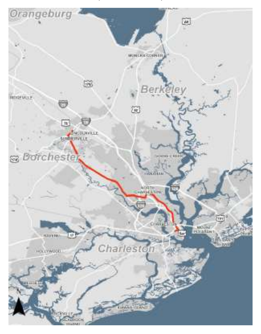
Figure 7: Corridor E | Summerville to Downtown Charleston (International Blvd)

Corridor E was the best performing corridor based on the screening metrics. The key to Corridor E is the potential to serve the region's second largest employment cluster (Airport/Boeing). Additional coordination is needed with the Airport and Boeing to better understand how the alignment for Corridor E could be modified to serve this area; especially since, at the time of this analysis various airport roadway access plans were being considered. Lastly, Corridor E has the opportunity to travel on the future LCRT alignment. BRT is recommended for this corridor and will advance into more detailed analysis.