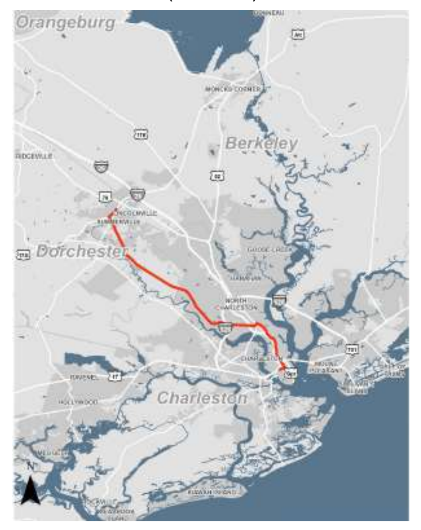
Figure 8: Corridor F | Summerville to Downtown Charleston (Dorchester Rd)

Corridor F performed very well during the analysis, and is quite similar to Corridor E. However, the route does not deviate to serve the Airport/Boeing employment cluster, instead it continues to the Superstop at Cosgrove Avenue and Rivers Avenue and eventually to downtown Charleston along the LCRT alignment. Due to its duplication and similarities with Corridor E, it is recommended that Corridor F does not move forward.