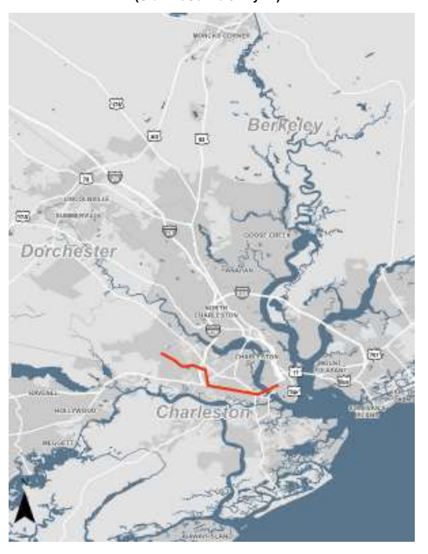
Figure 13: Corridor K | West Ashley to Downtown Charleston (Glen McConnell/Hwy 17)

The recommendation for this corridor is BRT. BRT can provide West Ashley residents reliable travel times to/from downtown Charleston via Highway 17 especially since traffic congestion is expected to continue to be high in the future.