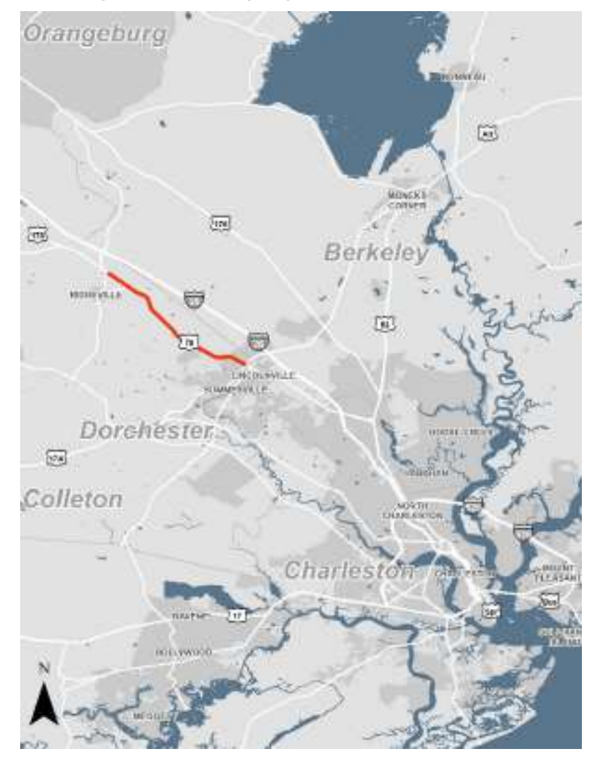
Figure 6: Corridor D | Ridgeville-Summerville (HWY 78)

Actions that should be taken to prepare the corridor for future additional transit service include preserving ROW and ensuring neighborhood connectivity to ensure efficient transit access.