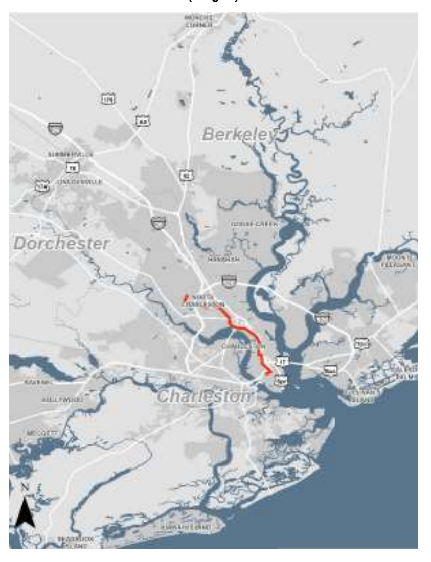
Figure 11: Corridor I | Airport/Boeing to Downtown Charleston (King St)

Due to its moderate performance, duplication and similarities with Corridors E, F, and H it is recommended that Corridor I not move forward for additional analysis.