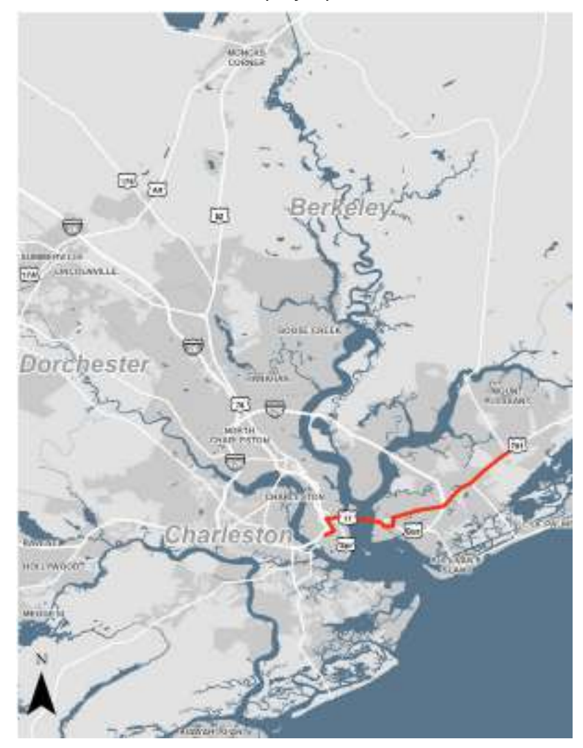
Figure 16: Corridor N | Mt Pleasant to Downtown Charleston (Hwy 17)

The recommendation for this corridor is BRT. BRT would be able to provide Mt Pleasant residents reliable travel times to/from downtown Charleston via Highway 17 especially since traffic congestion is projected to continue to be high in the future.