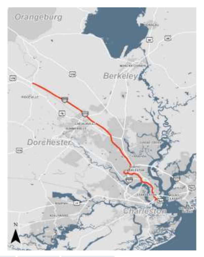
Figure 3: Corridor A | Ridgeville to Airport to Charleston

bus service that may include lane enhancements, bus on shoulder and/or high occupancy lanes.