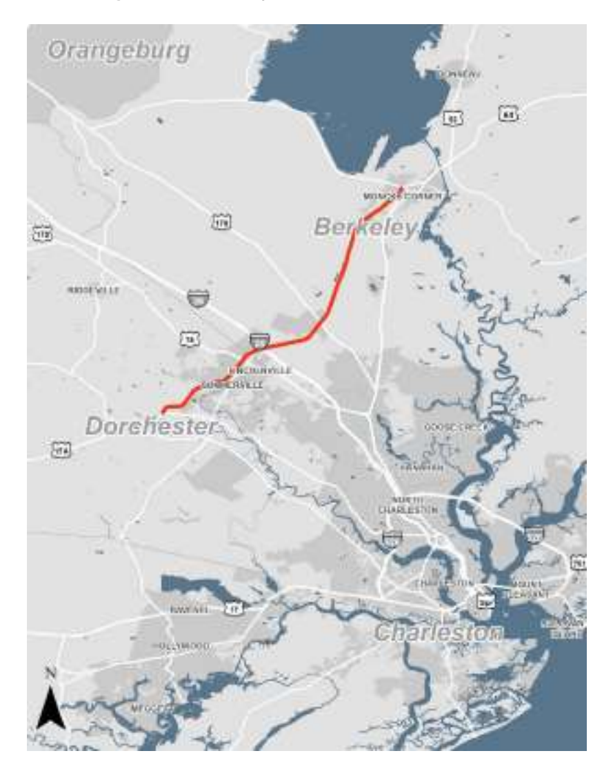
Figure 4: Corridor B | Moncks Corner to Summerville

As growth is projected for the area in the future, important actions are needed to provide additional mobility once demand materializes. Actions such as preserving ROW, neighborhood connectivity, and adding transit service to establish transit ridership in the corridor for eventual HCT improvements need to be considered.