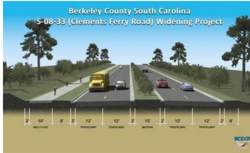
Project Map / Design Image